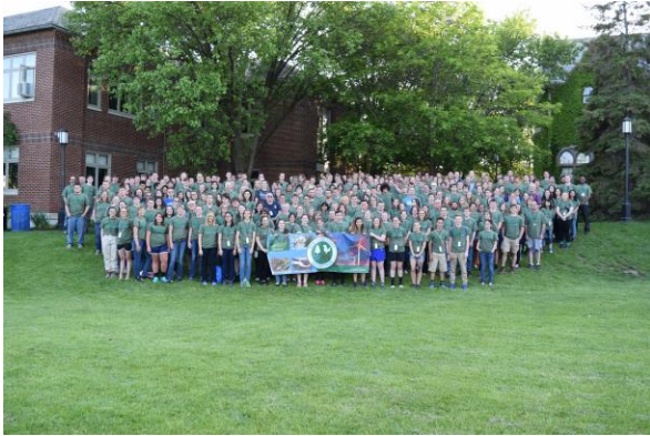
Proud Supporters of the NYS Envirothon!!