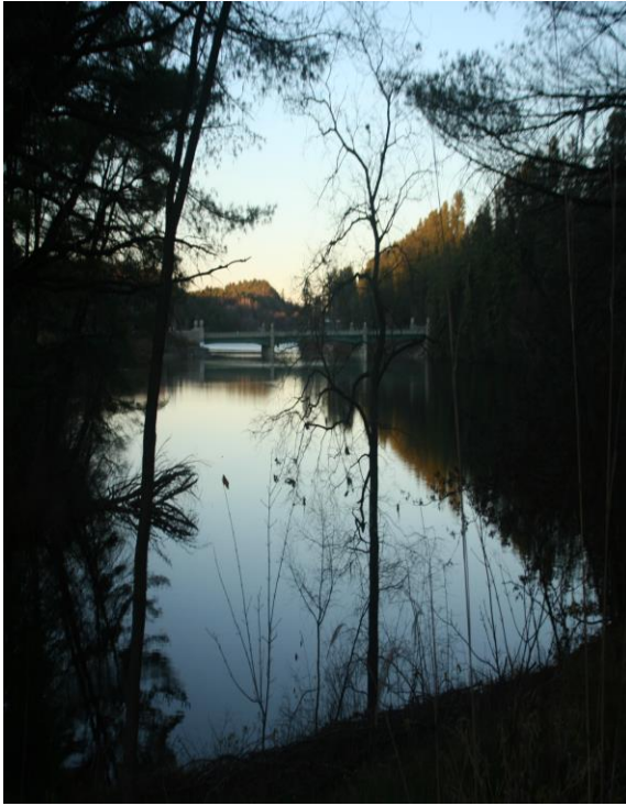
Keeping our Eyes Focused on Our Future!